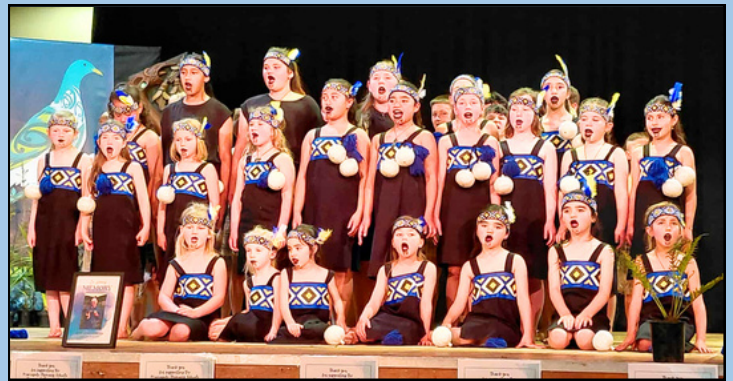
Aria School performing at the Maniapoto Festival held in November 2025 at Les Munro Centre, Te Kuiti.